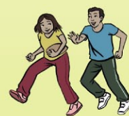
Playing a sport