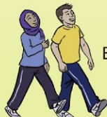
Brisk walking/ jogging